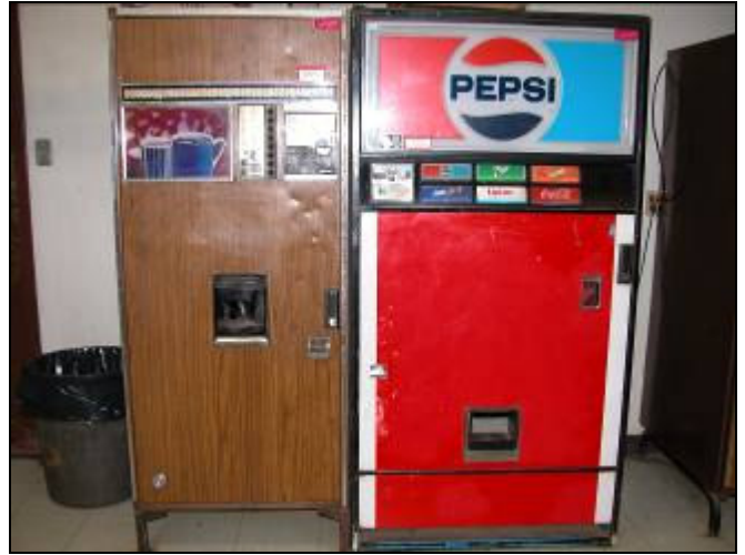
Prohibited: If Freon/CFC system is intact