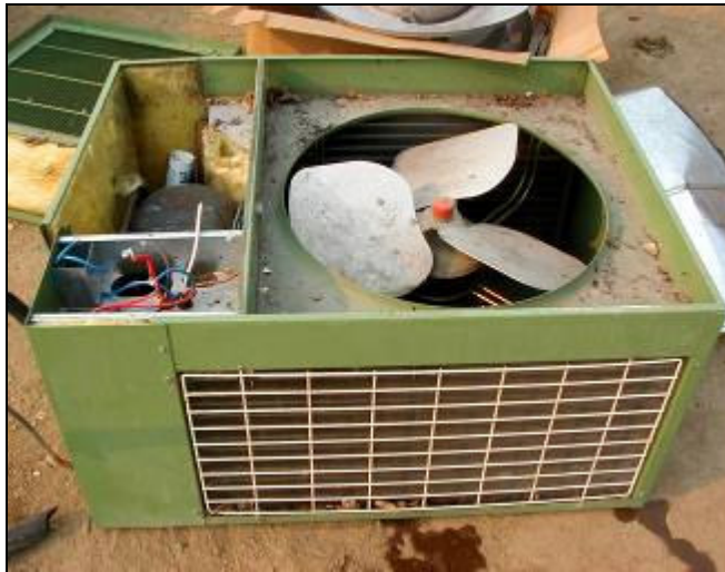
Prohibited: If Freon/CFC system is intact