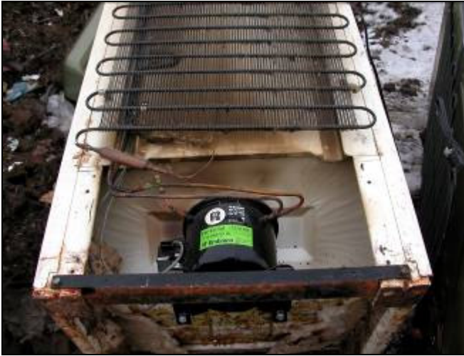
Prohibited: If Freon/CFC system is intact