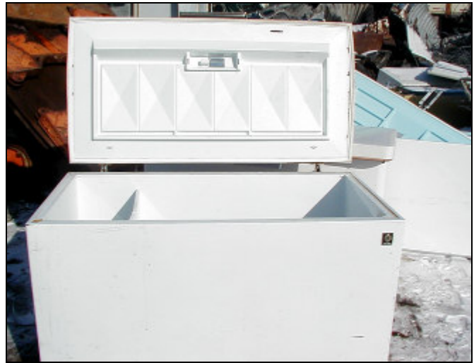
Prohibited: If Freon/CFC system is intact