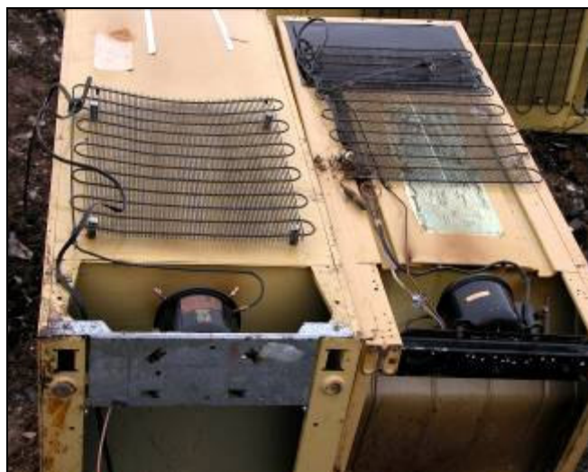
Prohibited: If Freon/CFC systems are intact